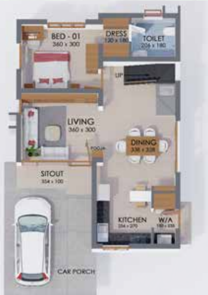
GROUND FLOOR PLAN ➤ N