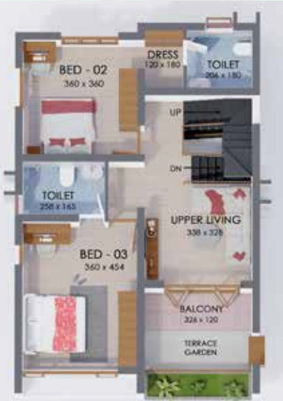
FIRST FLOOR PLAN ➤ N