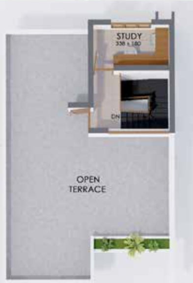
SECOND FLOOR PLAN ➤ N