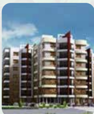
MAYURA REGENCY Azad Road Cochin