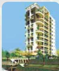
PERIYAR VIEW Periyar Gardens, Aluva