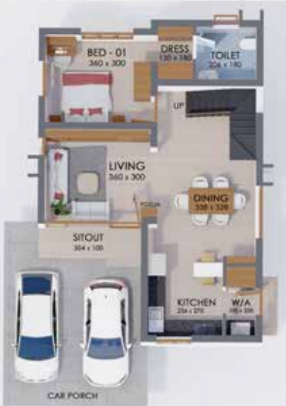
GROUND FLOOR PLAN ➤ N