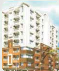
PALACE VIEW Aluva Project