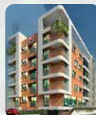
MAYURA HERITAGE Thripunithura