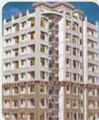
CHAITANYA APARTMENTS Aluva