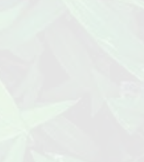
RATNA GARDENS Palarivattom