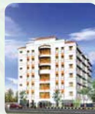
KOMAL ARCADE Palarivattom