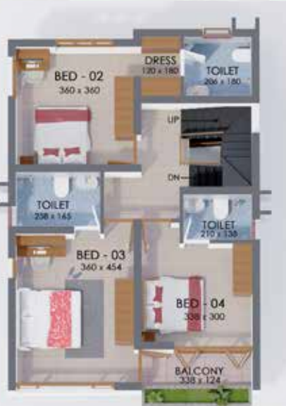
FIRST FLOOR PLAN ➤ N