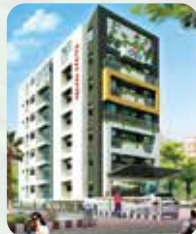
MAYURA ARCADE Tripunithura